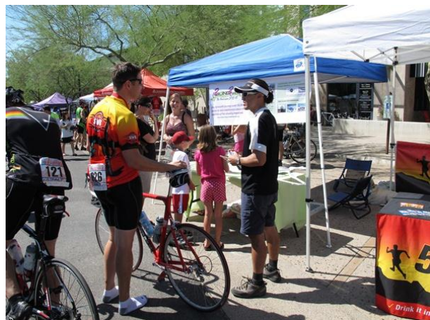
We share our the Americas 2012-13 ride.

Overall, the event was a success in that we talked to a lot of people and “opened their eyes” to the visually disabled community.