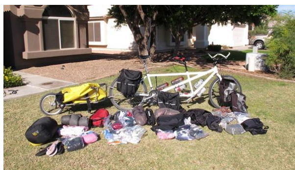
Just about everything we'll be bringing along for the ride.

However, as you can imagine, what we need for this trip is different. Small towns or villages along the way in South America may not have what we need, and we have to be self-sufficient in every way because we'll be on our own. This means carrying spares and tools for on-the-road fixes. (The 2B2R Info page contains our general gear list.)