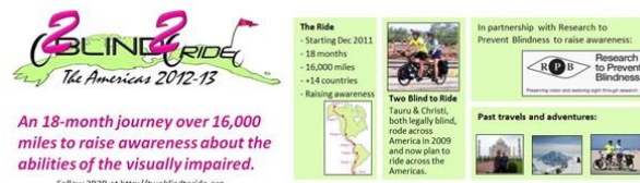
The 2B2R banner made for the Scottsdale Cycling Festival in Scottsdale, AZ.

For the event, we made a banner to draw people to our exhibit where we passed out info-sheets about 2B2R, 2B2R business cards, and brochures and pamphlets from Research to Prevent Blindness about eye conditions