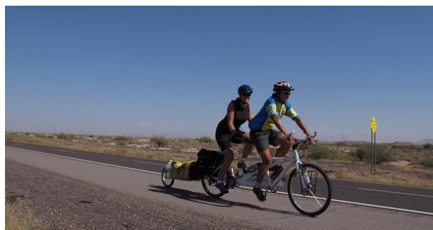
En route to nearby Gila Bend, AZ for the night. (See Oct 24 th and 27 th .)

We did, however, do a ride around the Phoenix area to test out what it felt like to pull a trailer.