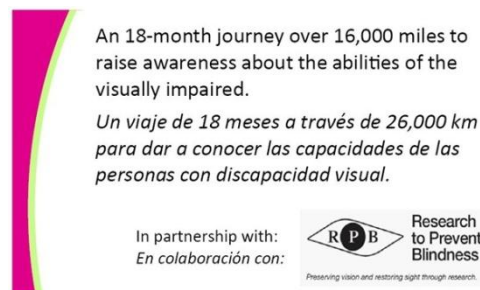
2B2R business card front and back.

Overall, the event was a success in that we talked to a lot of people and “opened their eyes” to the visually disabled community.