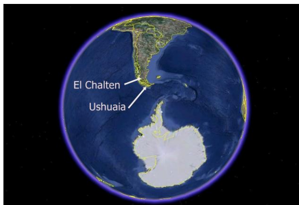
Step by step to tackle 16,000 miles.

At the moment, we only have an idea of how we're going to move northward—that is, ride north, cross into Chile to Punta Arenas, continue north to see Torres del Paine National Park, then onward to El Chalten.