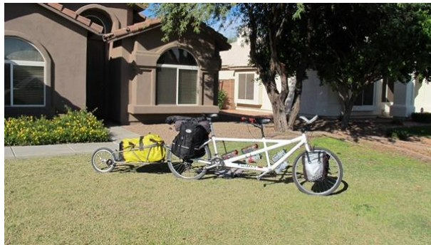
Loaded at ~145 lbs and 11 1/2 feet long. (See December 19, 2011 update for video.)

The total weight for the bike and gear will be roughly 155 pounds once we include provisions enough for up to seven days. Flat ground will be greatly appreciated, and downhill's will be fun. As noted in Article #3 Riding in Tandem , we have a front disc brake that acts as a drag brake. It will come in handy on those long and/or steep descents where the weight of two people and a fully loaded tandem bike will propel us like a rocket down the mountain.