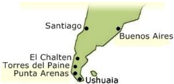
Stage 1 is north-bound to Saniago: ~1,800 miles with ETA ~end-March 2012.

Once in Argentina, we'll get a map and figure out which roads and highways to take. The rest of the way will unfold as we move along. Part of the adventure is the unknown and the surprises that come with it.